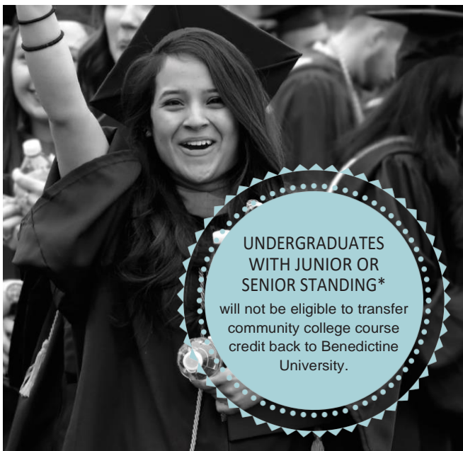
*60 or more semester credit hours earned